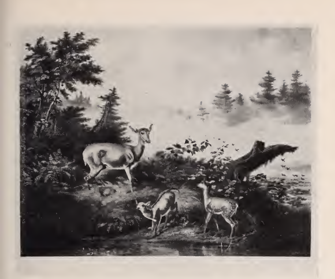
MORNING IN THE ADIRONDACKS [NUMBER 307]